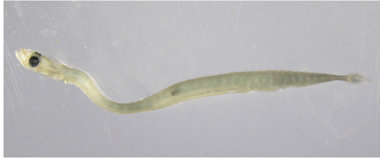
Fig. 1. Male Schindleria praematura (16.6 mm SL), collected from the Red Sea