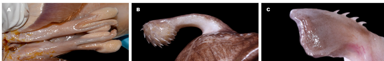
Fig. 3. Male sexual characters of Chimaera opalescens (MMF37260, 858 mm TL): claspers (A), frontal tenaculum in dorsal view (B) and prepelvic tenaculum in ventral view (C)

Material from Madeira and NW Africa (5 males, 2 females) represents the presently reported study; Material from British Isles and France (15 males, 15 females) represents data of Luchetti et al. 2011; TL = total length, PCL = pre-caudal length, PD2 = pre-second dorsal fin length, PD1 = pre-first dorsal fin length, HDL = head length, DSA = dorsal spine length along anterior margin, D1B = first dorsal fin base length, IDS = inter-dorsal space, D2B = second dorsal fin base length, CFI = caudal-filament length, P1A = pectoral-fin anterior margin length, P2A = pelvic-fin anterior margin length, EYL = eye length, EYH = height, CLT = total length of clasper.