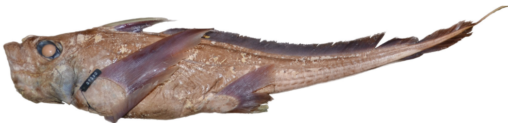
Fig. 2. Chimaera opalescens from NW African slope (MMF37260, 858 mm TL, male, 26.05°N, 15.27°W; 897 m)

Before this study, only two species of the family Chimaeridae were known to occur in Madeira, Chimaera monstrosa (see Maul 1949) and Hydrolagus affinis (de Brito Capello, 1868) (see Freitas et al. 2011). While re-examining the MMF specimens, originally identified as C. monstrosa , we came to the conclusion that they were in fact Chimaera opalescens . Since we were not able to locate specimens of C. monstrosa from Madeira in museum collections and Maul's (1948) reference is older than the oldest specimen in MMF, the occurrence of C. monstrosa in Madeira remains dubious.